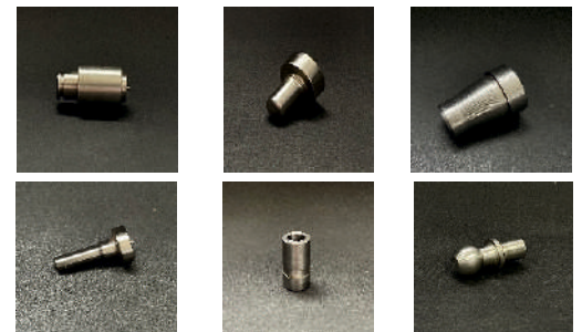
Components Provided On Machine

Note: We reserve all rights to modify specification in accordance with the improved designs. Although every effort will be made to maintain the accuracy, in the figures must be taken as approximate and in no way binding.